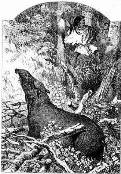
THE TAPIR FALLING INTO THE TRAP.—Page 139.

further caution, walked straight towards where the tapir lay. The Indian knew by experience that the latter, when roused, would make directly along its accustomed trail to the water; for to the water it always flies when alarmed by an enemy. When they had got within a few paces of the den, a movement was seen among the leaves—then a crackling