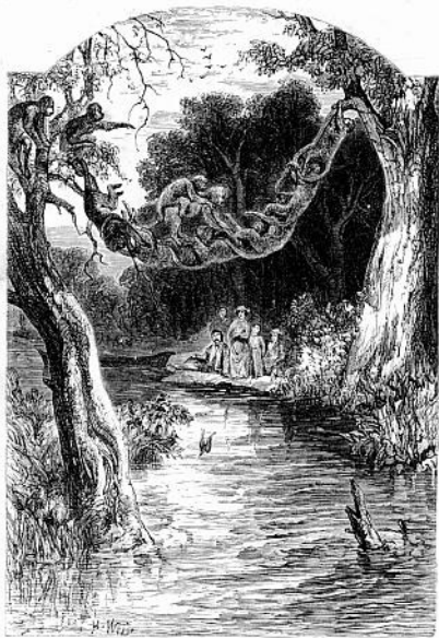
THE MONKEY'S BRIDGE.—Page 136.

The troop now proceeded to cross over, one or two old ones going first—perhaps to try the strength of the bridge. Then went the mothers carrying