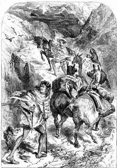
THE FLIGHT OF THE REFUGEES.—Page 15.

There were four animals that carried our travellers and their effects. One was a horse ridden by the boy Leon. The second was a saddle mule, on which rode Doña Isidora and Leona. The other two animals were not mounted. They were beasts of burden, with "yerguas," or pack-saddles, upon which were carried the few articles