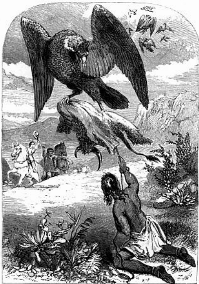
CAPTURING A CONDOR.—Page 87.

time, therefore, they descended lower, and lower,—and then one of the very largest dropped upon the ground within a few feet of the hide. After surveying it for a moment, he appeared to see nothing suspicious about it, and hopped a little closer. Another at this moment came to the ground—which gave courage to the first—and this at length