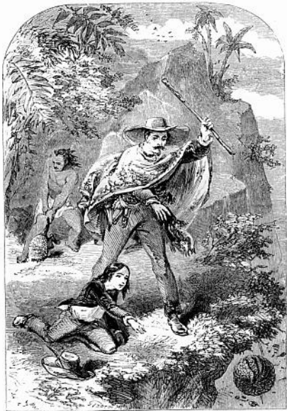
THE ESCAPE OF THE ARMADILLO.— Page 202.

Guapo soon overhauled his one, but, before he could lay his hands upon it, it had already half buried itself in the dry ground. Guapo, however, seized the tail and held on; and, although not able to drag it out, he was resolved it should get no deeper.