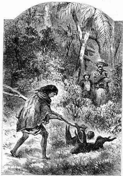
GUAPO AND THE "NIMBLE PETERS" — Page, 209,

out upon the slender branches, where it would have been