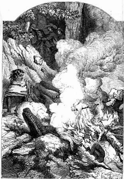
AN UNEXPECTED GUEST.—Page 345.

of any voice being heard above the rest. It was, indeed, a scene of confusion. Don Pablo and his companions were running to and fro—Guapo was tumbling about where he had fallen—and the great lizard was writhing and flapping his tail, so that pots, pans, half-burnt faggots, and even Guapo's monkey, were being knocked about in every direction.