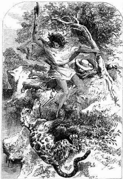
DEATH OF THE JAGUAR.—Page 287.

In a moment he would have sprung up, and then woe to his antagonist! but he was not allowed that moment, for he had scarcely touched the rock when the Indian leaped forward and struck at his head with the axe. The blow was not well aimed, and although it stunned the jaguar, he still clung to the cliff. In setting himself for a second